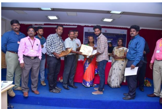
Chief Guest honouring the Entrepreneur