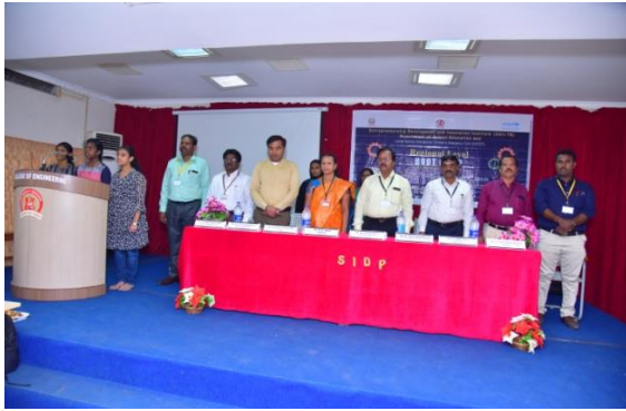
Tamil thai vazhthu