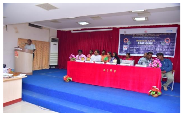
Chief Guest Address