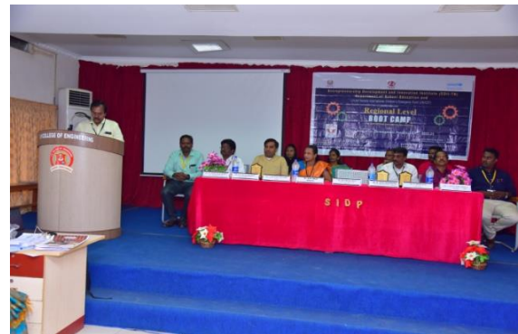
Chief Guest Address

About 210 students & 42 teams, 42 Guide teachers and 9 Mentors from different schools actively participated in this event.