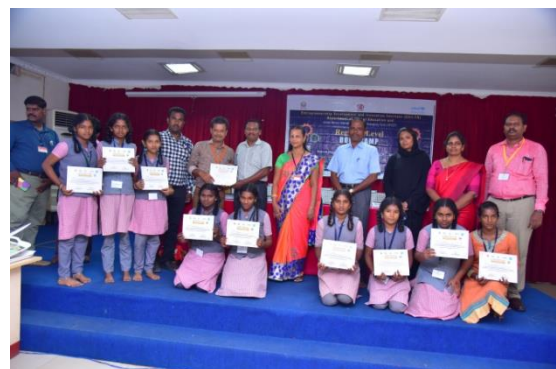
Students receiving certificates

All students, guide teachers and mentors who have participated in the boot camp were awarded with a certificate as token of appreciation. Also participation certificates were distributed to all the volunteers who have given their helping hands throughout the camp. The participants were motivated by the rich experience & guidance of Chief Guest & Guest of Honor.