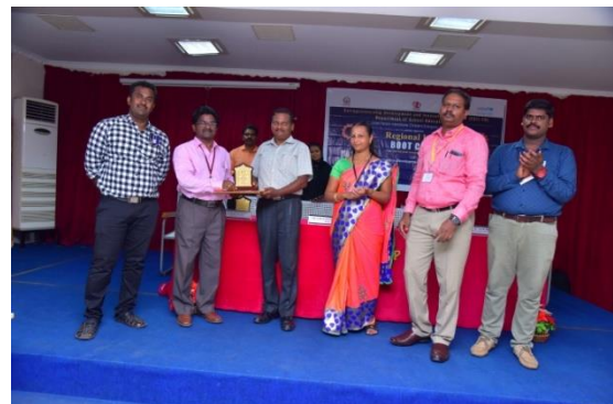
Mentor receiving the memento